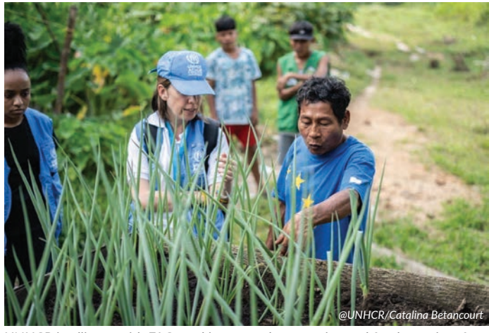
UNHCR in alliance with FAO working towards protection and food security of displaced communities with mobility restrictions in Chocó (2023).