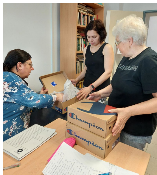
Refugees from Ukraine receiving shoe donations from at distribution point in Veszprem County

1 Multi-country office in Budapest, also supporting national offices in the Czech Republic, Slovakia and Slovenia.