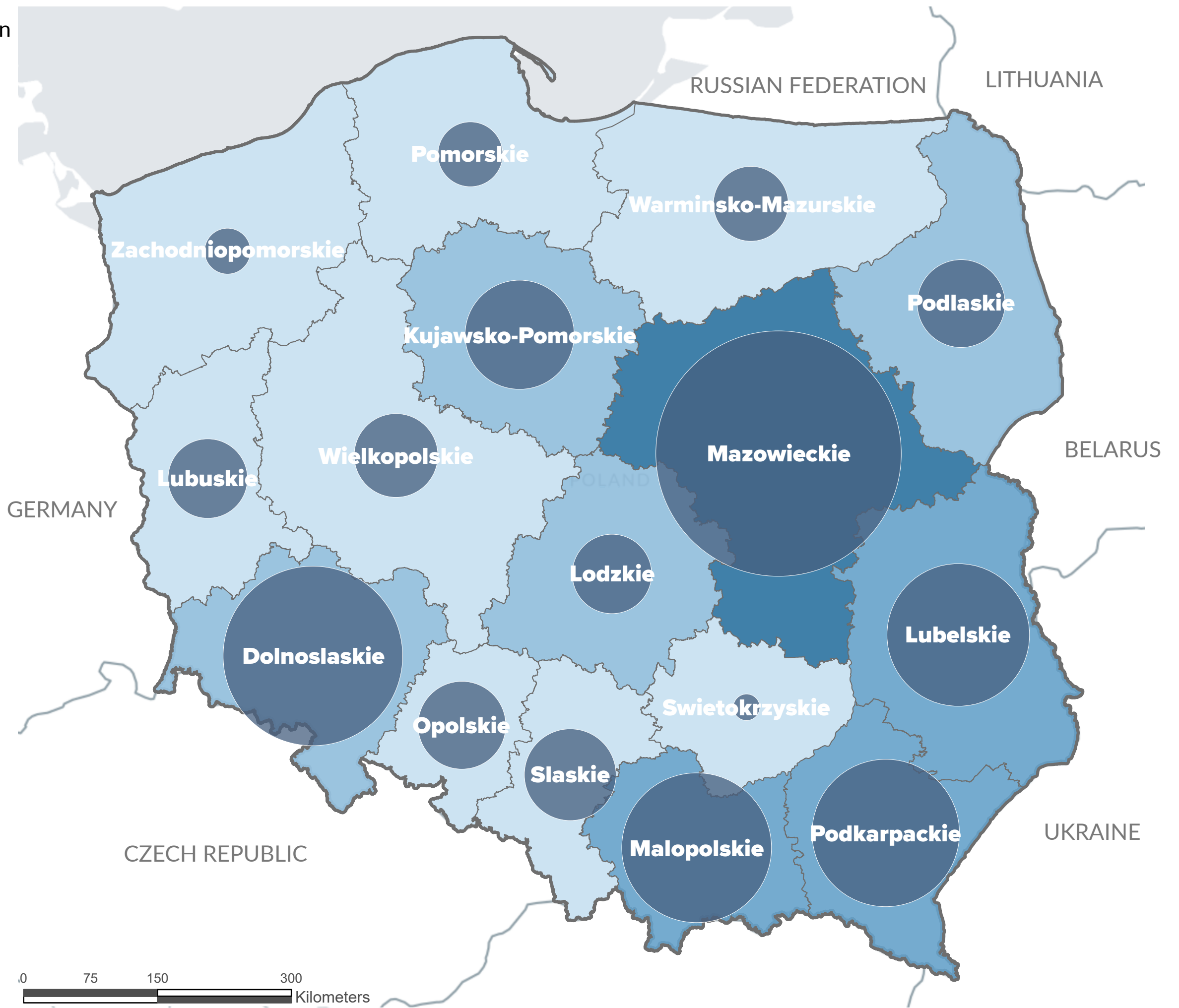
# of activities per area of intervention by voivodeship