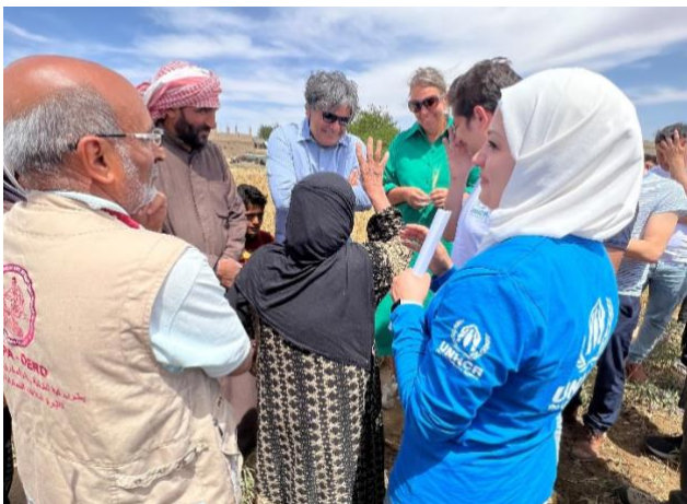
In May, the UNHCR Representative and the Ambassador of Switzerland visited UNHCR projects in Deir-ez-Zor Governorate, north-east Syria, including farmers who had received agricultural inputs.