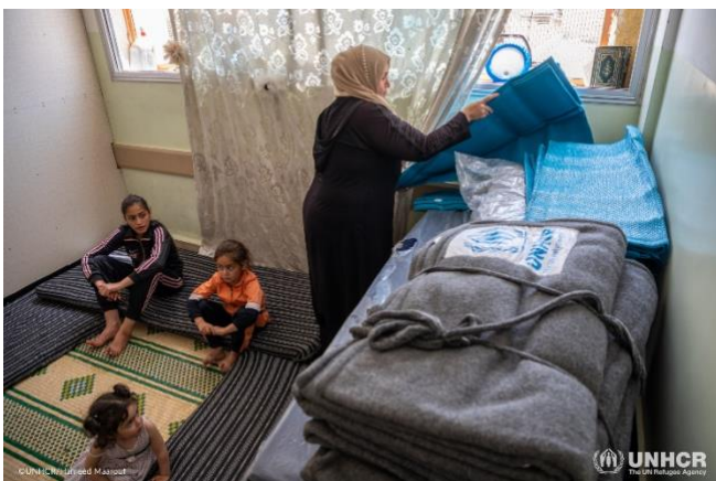
UNHCR and partners supported the rehabilitation of mid-term collective shelters for people affected by the earthquakes in Aleppo Governorate.