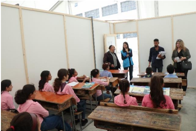
Children attend classes in one of the Rubb halls installed by UNHCR in Latakia Governorate.

UNHCR and partners have so far rehabilitated seven collective shelters in Aleppo and Latakia Governorates. Rehabilitation works include the installation of gender-segregated WASH facilities and partitions for added hygiene and privacy. In addition, in Latakia Governorate, UNHCR completed the delivery of eight Rubb halls in seven schools acting as collective shelters. The Rubb halls are being used as temporary classrooms for children.