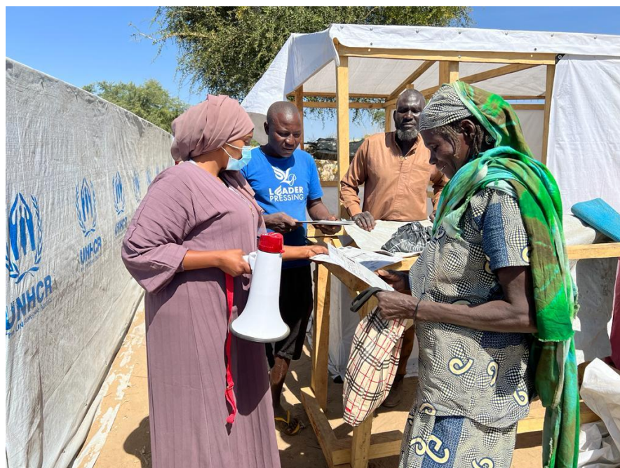
Cameroonian refugees documentation