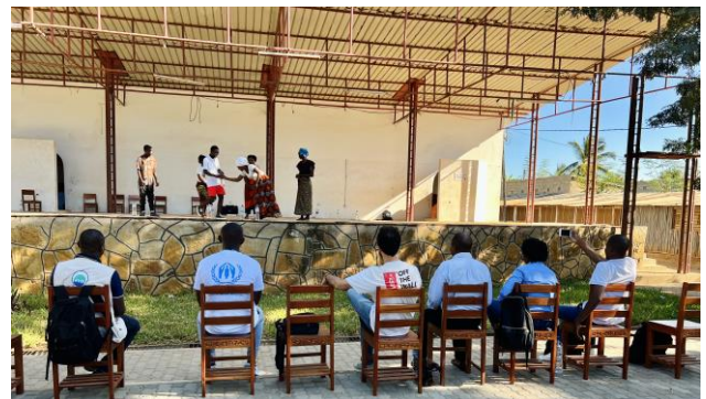
Theater as a mean of social cohesion: UNHCR and partner AVSI followed a request of community mobilisers and IDPs to acquire skills that would help them spread peace messages and foster dialogue