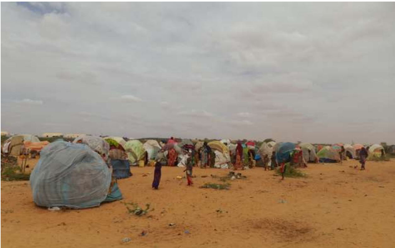
New arrivals in Kabasa IDP camp, Doolow district, Somalia.

As a part of its drought response, UNHCR in Mogadishu distributed cash in lieu of emergency shelter to 600 IDP households (2,400 individuals), with each family receiving USD 213 and cash in lieu of core relief items (CRI) kits to 258 IDP households (1,548 individuals). 200 IDPs. In addition, 62 latrines were rehabilitated, and 45 latrines went through the desludging process in the two locations.