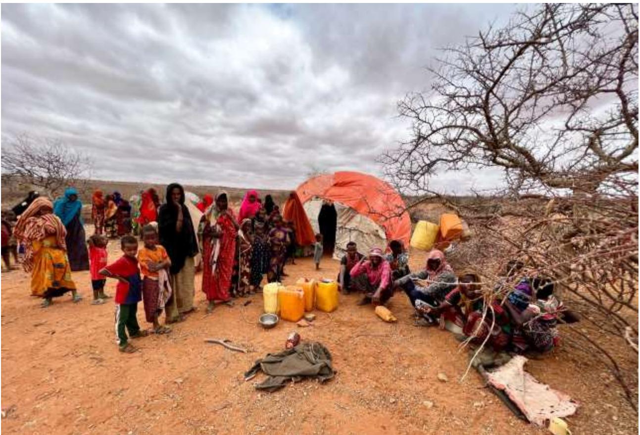
Despite the arrival of some rains, the humanitarian consequences of the drought for displaced families in south-west Ethiopia persist.

Upon registration and verification of these families, a total of 17,579 persons in the Koraha, Shabelle, Erer, and Nogob zones of the Somali region will receive a multipurpose cash grant (MPC) to a tune of ETB 23 million (equivalent to USD 426) through the Ethiopian Commercial Bank branches on behalf of UNHCR.