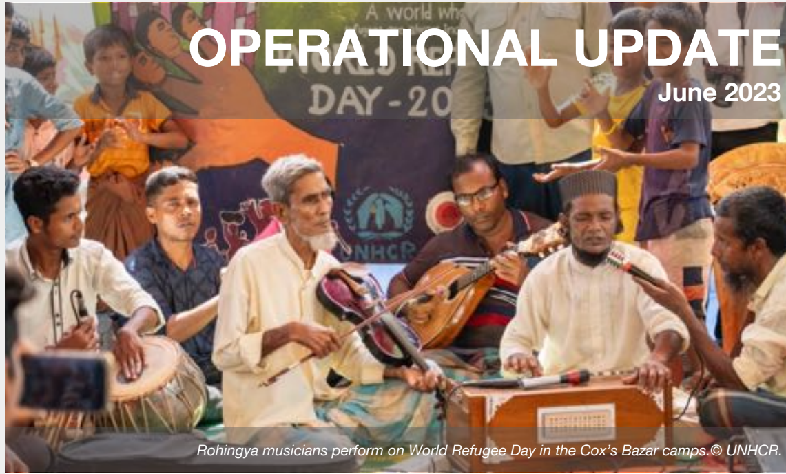
Rohingya musicians perform on World Refugee Day in the Cox's Bazar camps.