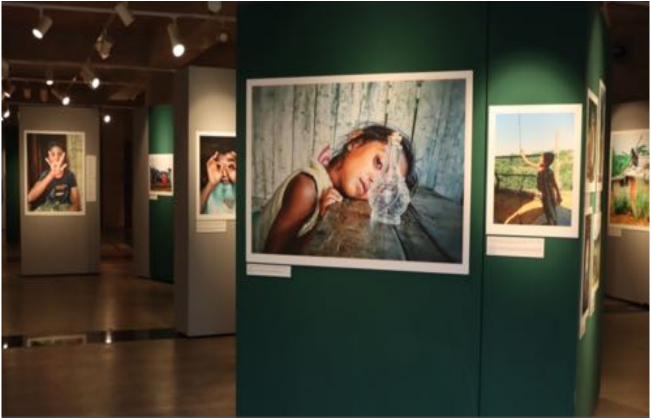
World Refugee Day exhibition at the Liberation War Museum in Dhaka.