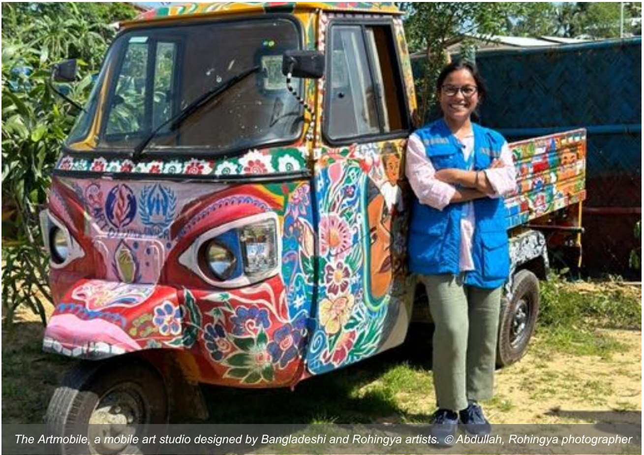
The Artmobile, a mobile art studio designed by Bangladeshi and Rohingya artists.