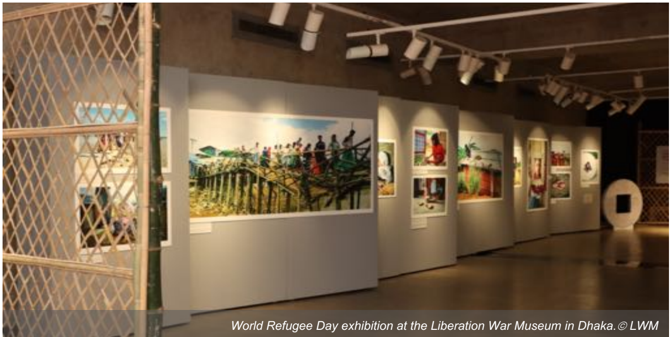
World Refugee Day exhibition at the Liberation War Museum in Dhaka.