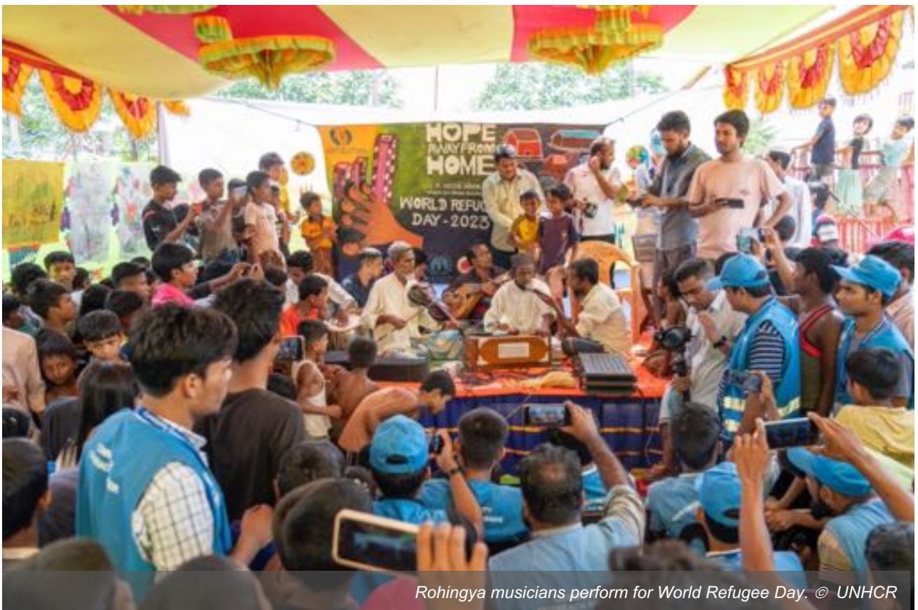
Rohingya musicians perform for World Refugee Day.