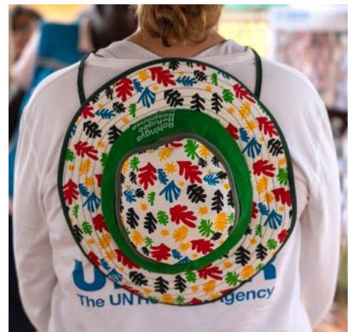
UNHCR Deputy High Commissioner Kelly Clements sports an eco-friendly jute sunhat produced by refugee women at the jute skills development and production centre.