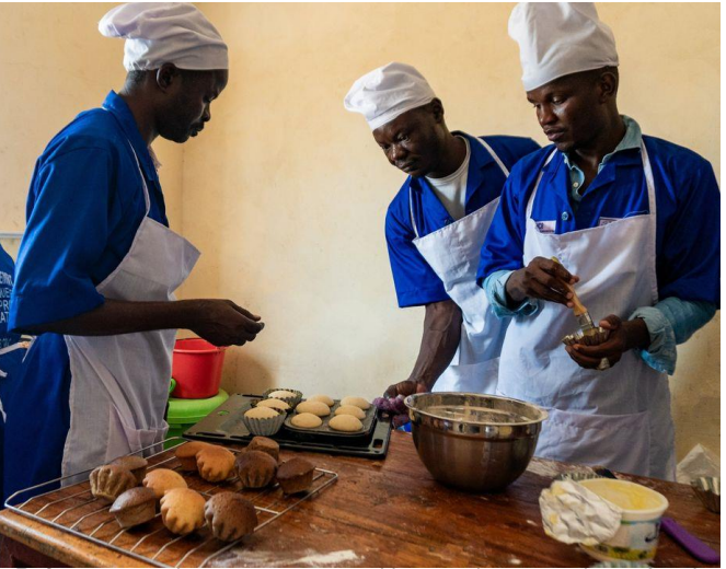
take makina classes Refuaees pastrv in

А socio-professional training program, involving five host community members and 25 refugees, was launched on 25 July in Agadez as part of the mixed migration monitoring and livelihood strengthening project. The training aims to generate income and redistribute it within the region, promoting income generation fostering and cohesion and peaceful coexistence between the two communities. Furthermore, it contributes to resilience and facilitates socio-economic integration of beneficiaries. The training duration spans 60 to 75 days and consists of theoretical classes and practical internships aligned with the chosen fields of study. 11 women and 19 men will