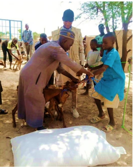
Households of refugee herders in Dan Daji Makaou receive goat kits