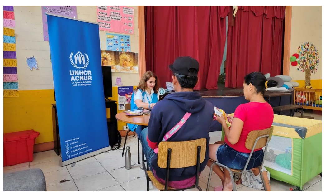
UNHCR assists people in need at the Transitional Care Center in Iquique, Tarapacá Region, which is financed by the Undersecretariat for Children (under the Ministry of Social Development and Family).