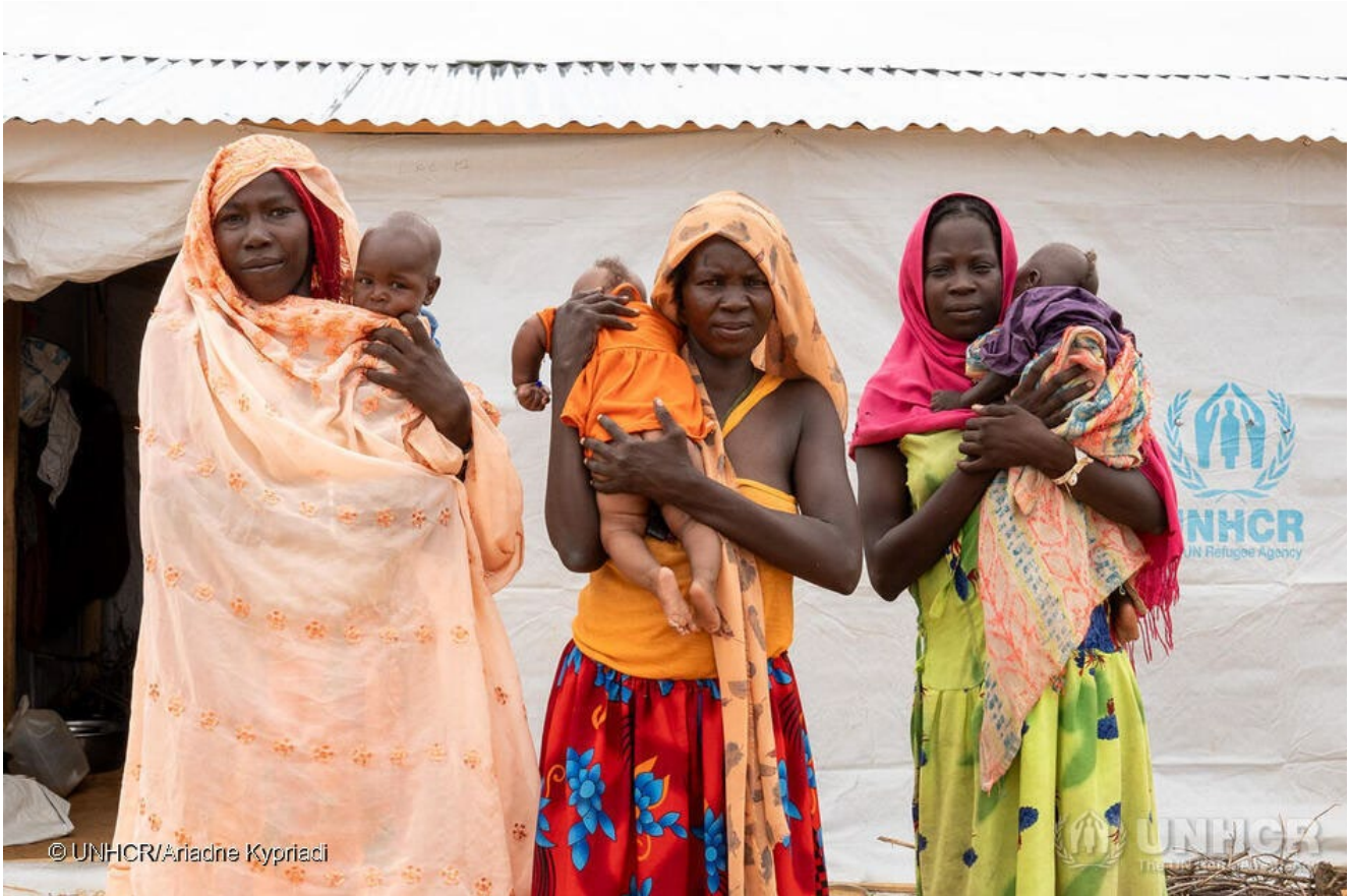
These three refugee women were friends back home in their village of Kanga in Sudan. They now live in the Arkoum refugee camp, in Ouaddai province, Chad.