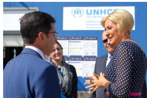
Ms Agata Kornhauser-Duda, First Lady of Poland visiting UNHCR's integrated service hub in RomExpo, Bucharest on 7 September 2023.