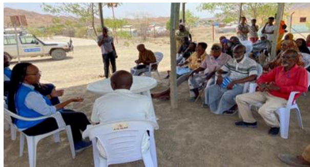
Information meeting with refugee leaders on resettlement activities Ali-Addeh refugee village

In addition, the UNHCR Ali-Sabieh field office held an information session for refugee community leaders in the village of Ali-Addeh on Sunday, July 30, 2023. The aim of the session was to inform refugees about the re-submission of cases to the United States of America and Canada, as well as to raise their awareness once again against any type of fraud. The aim of this re-submission is to ensure the re-examination of cases previously shortlisted for resettlement to third countries as part of durable solutions.