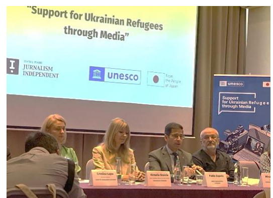
UNHCR Representative delivering keynote speech at the event "Support for Ukrainian Refugees through Media" on 7 September..