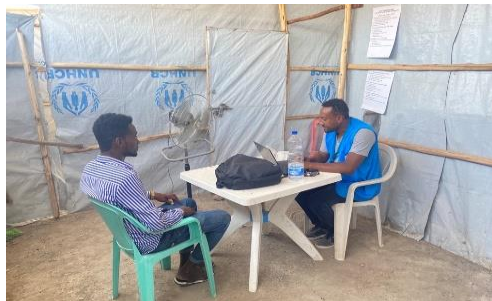
Litigation desk Semera; Afar Serdo camp