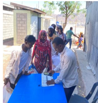
Admission- Semera; Afar Serdo camp @UNHCR