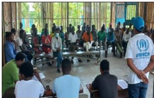
Community Communication Session on GFD resumption in Okugo Camp