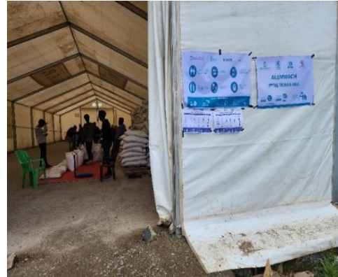
Visibility in different languages in Alemwach site

Protection Monitoring and Communication with communities: UNHCR, in partnership with WFP and their cooperating partners (CP), RRS and refugee leaders continue to disseminate key messages in Amhara, Gambella, Melkdadida, Jijiga, Oromia (Kenya Borena refugees) and Southern Nations, Nationalities and Peoples (SNNP) in Ngatom South Omo (South Sudanese refugees). In every active GFD site, visibility material has been put up, with key messages regarding the steps to follow and the food entitlements to guide refugees through the process. These messages are displayed in local languages in addition to English. UNHCR and WFP conducted a joint mission to Dilo and Megado refugee settlements in Borena Zone of Oromia region in Ethiopia. The food distribution exercise in Dilo was conducted from 23-25 of October 2023 and it is scheduled to commence in Megado on 27 October 2023. Prior to food distribution in Dilo, sensitization sessions were organized by WFP and UNHCR and the jointly developed messages about the general food distribution was conveyed to the refugee community. During this mission, in a meeting held with refugee representatives, they expressed their happiness on the resumption of food distribution and extended their appreciation.