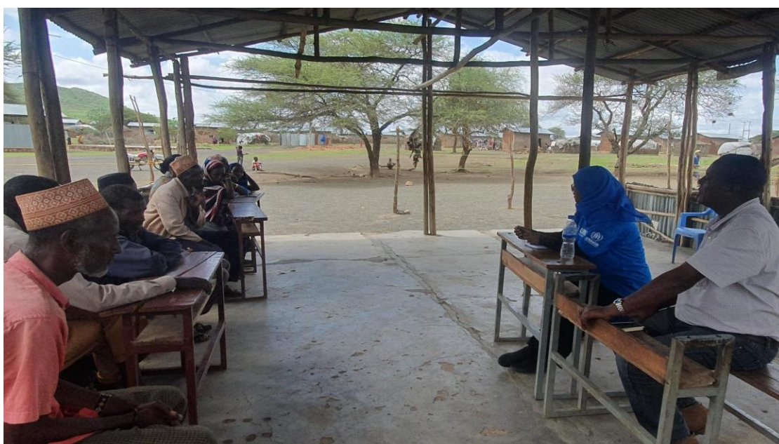
Sensitization session with refugee community representatives in Dilo (SNNP region)

Visibility materials: In Gambella, the visibility materials will be translated into local languages and audio recordings of the key messages will also be played in all sites during the distribution.