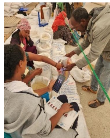
Scooping and use of mobile collect application in Alemwach site

In Kurmuk, Benishangul Gumuz, the regional Disaster Risk Management Commission (DRMC) also distributed food and various relief supplies to help support the newly arrived refugees in Kurmuk to mitigate the rising malnutrition cases. The peace committees, which include representative from both the refugee and host communities were very much engaged to ensure strengthened social cohesion. In Jijiga camps, there has been a general appreciation of the resumption, even though the food assistance is only limited to the refugees, while the host community is also dependent on food aid programs.