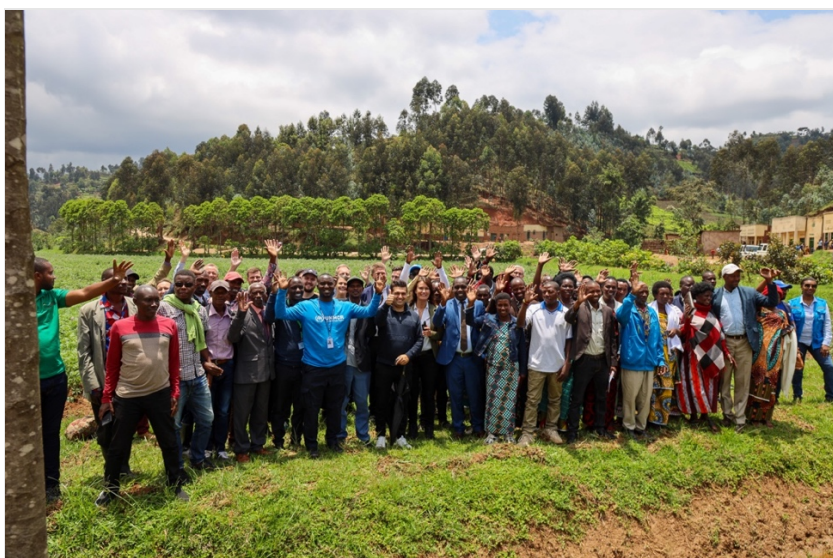
Politicians from Denmark visit Mushishito marshland near Kigeme refugee camp to meet with refugee and Rwandan farmers, September 2023.

UNHCR STAFF BASED IN THE HUYE FIELD OFFICE COVER THE NEEDS OF REFUGEES IN MUGOMBWA REFUGEE CAMP