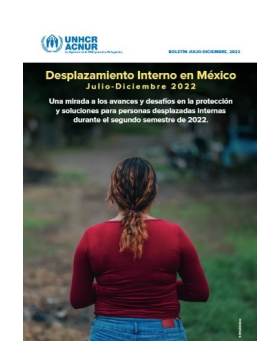
MEXICO. Internal displacement in Mexico- July to December 2022