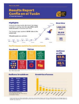
MCO PANAMA: Trust the Toucan Results Report