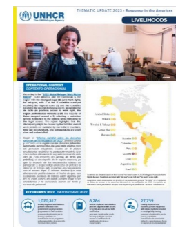
REGIONAL:Livelihoods thematic update- August 2023