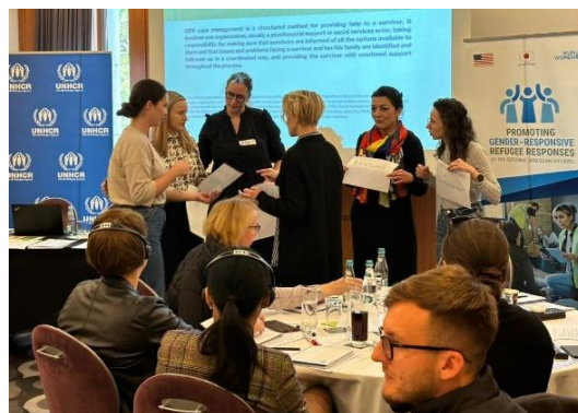
This week, 29 staff from NGOs and local authorities attended the gender-based violence case management training.

So far in 2023, UNHCR in Romania provided capacity-building training in protection to 1,242 staff from NGOs and local authorities. During the week, UNHCR, together with the National Agency for Equal Opportunities (ANES), UN Women and in collaboration with UNFPA and UNICEF held a training of trainers workshop on case management for gender-based violence (GBV). The training counted with the participation of 29 experienced representatives from local authorities and NGOs from Braşov, Bucharest, Cluj, Constanţa, Ialomiţa, Iaşi, Sibiu, and Timișoara counties. In addition, on 2 November, UNHCR held a training session on the Age, Gender, and Diversity approach for 14 staff from partner NGOs.