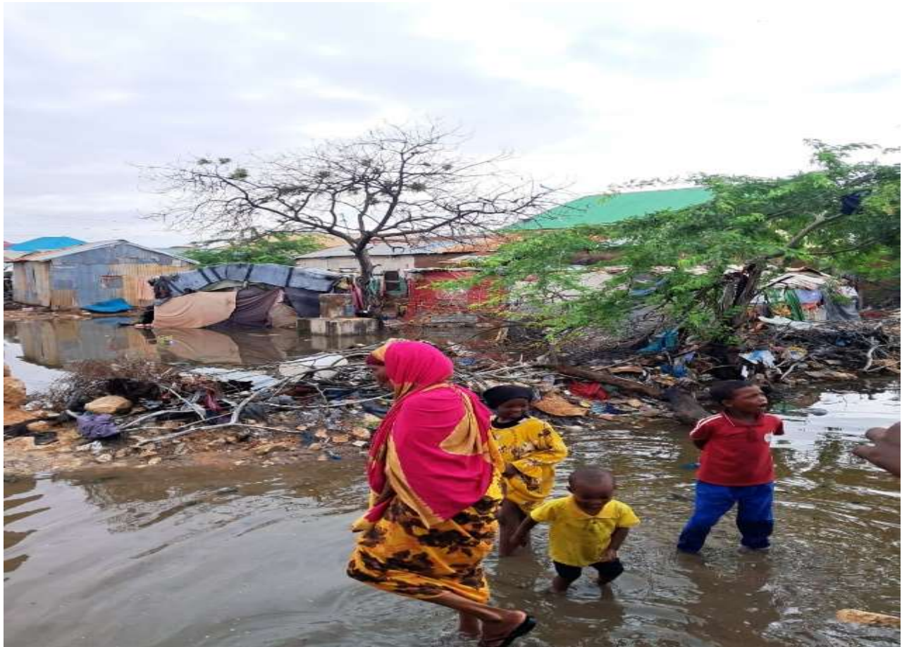
Figure 1: Flooding in Bulo Baclay Site - North Galkacyo