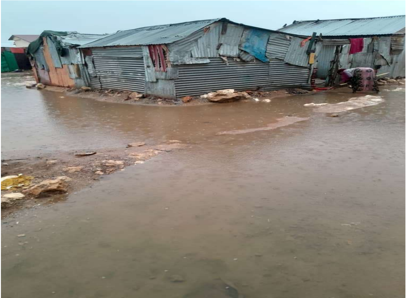
Figure 2: Flooding in Bulo Kontrool Site- North Galkacyo