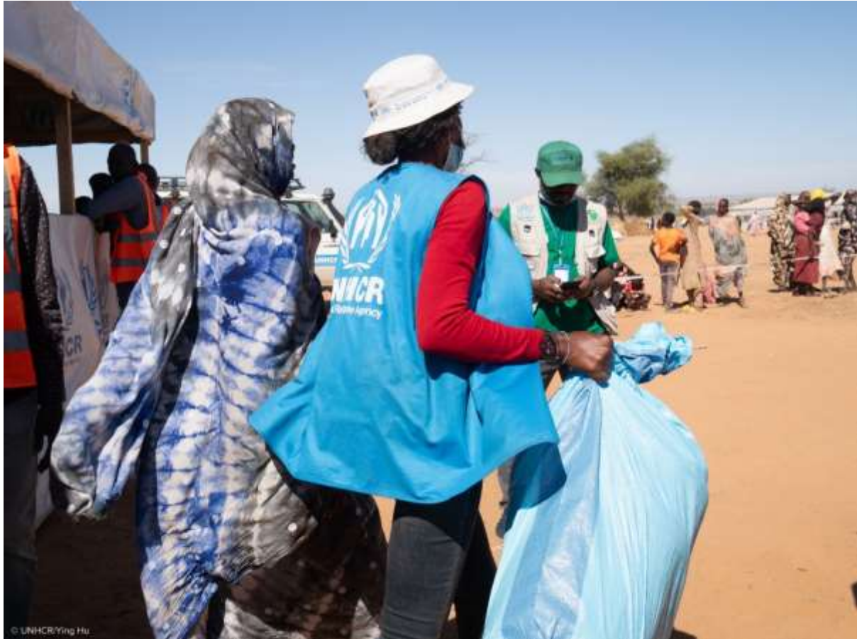
On 30 November, UNHCR and partners began the relocation of Sudanese refugees living in makeshift shelters in the Chadian border town of Adre to Alacha, a newly built refugee site.