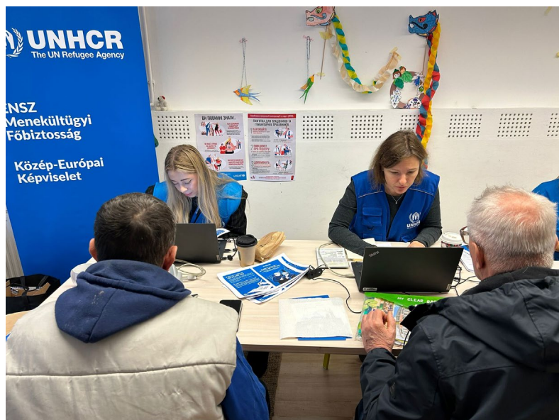
UNHCR colleagues registering elderly refugees from Ukraine for the winter cash assistance program in the Budapest Helps! Community Center.

1 Multi-country office in Budapest, also supporting national offices in the Czech Republic, Slovakia and Slovenia.