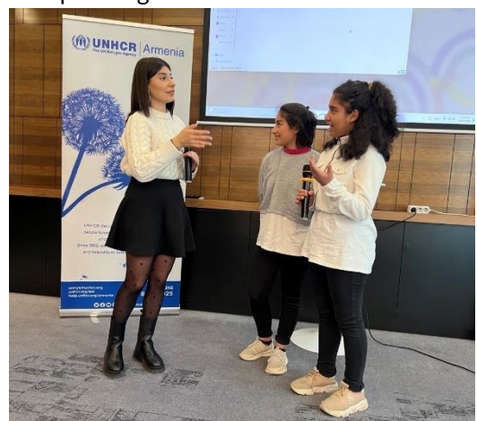
Syrian refugee siblings reflecting on their experience as part of the "Youth Integration and Participation" project. December 2023. Yerevan

80 refugees and host community older persons participated in a community event (23 December) organised in Goris, Syunik region. The initiative aimed to strengthen social cohesion and was part of UNHCR's targeted outreach to older refugees in Lori, Tavush, Shirak, and Syunik regions.