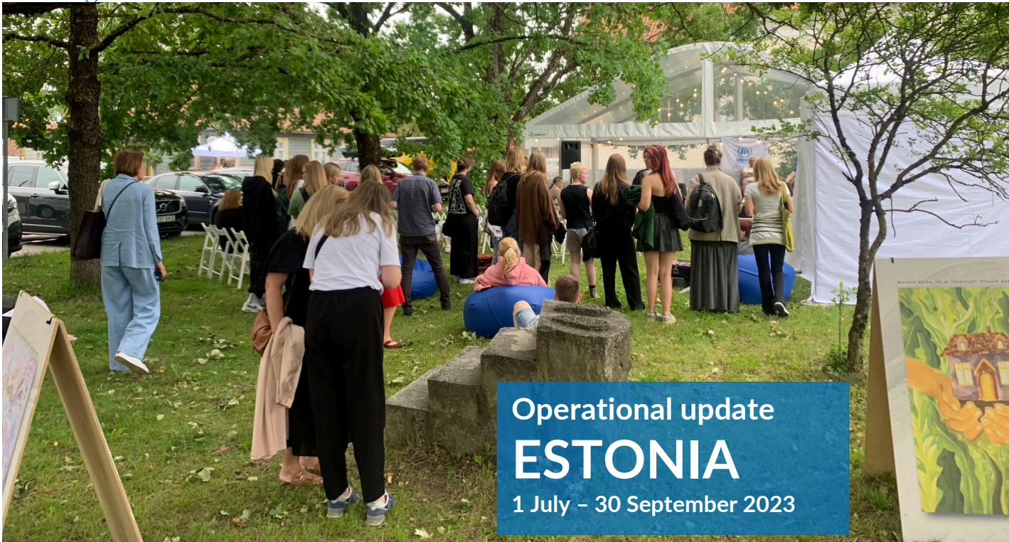
On 11 August, UNHCR participated in the Arvamus Festival, an annual event held in Paide, Estonia, aimed at enriching the culture of debate within the country.