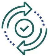
Updates & Achievements