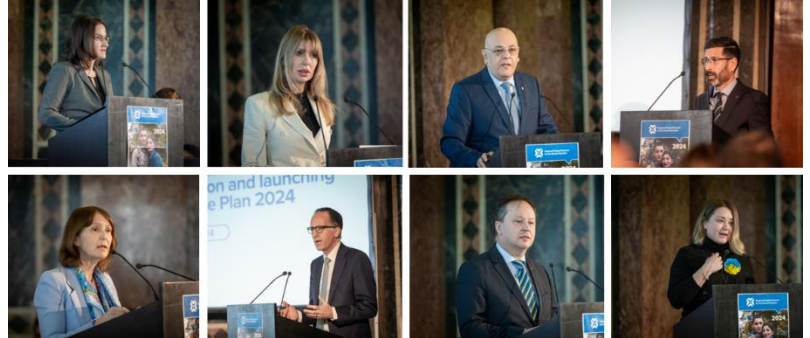
Remarks by authorities, UNHCR Representative, Ambassadors and refugee representative at the event to mark two years of Romania's response to the Ukraine refugee situation.

On 23 February, to mark two years of Romania's response to the Ukraine refugee situation and the launching of the Regional Refugee Response Plan (RRP) 2024 , the Chancellery of the Prime Minister, the Department for Emergency