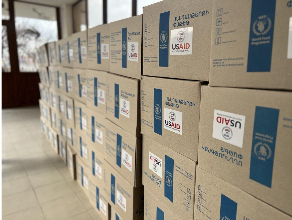
Food assistance is currently in process, with the support of USAID's Bureau for Humanitarian Assistance (BHA) and the UN's Central Emergency Response Fund (CERF), covering the food needs of refugees residing in Aragatsotn, Ararat, Armavir, Gegharkunik, Kotayk, Lori, Shirak, and Tavush provinces.