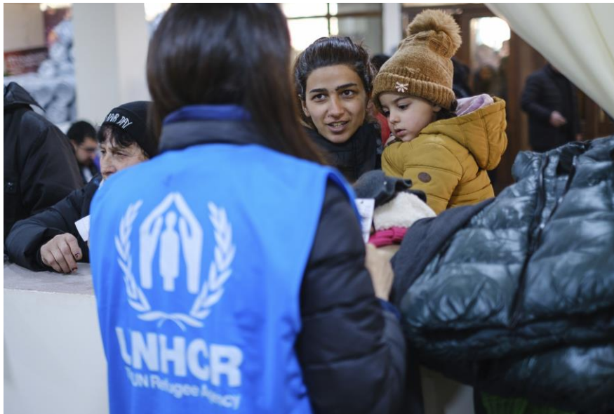
Refugees await the arrival of winter clothing and core relief items, distributed by UNHCR and its partner Mission Armenia NGO. February 2024. Sevan, Gegharkunik province, Armenia.

A new online application system is now active under the Unified Social Services (USS) that enables refugees to check their eligibility for government-led cash assistance programmes and the status of submitted applications. Through the Cash Working Group, the Ministry of Labour and Social Affairs announced that a new government-led multipurpose cash assistance programme is being designed. More details, including eligibility criteria and target groups will be shared in the coming month. Both developments highlight strengthened government cash assistance systems and a trend towards cash-based and more targeted refugee assistance. Meanwhile, winter-related in-kind assistance is winding down.