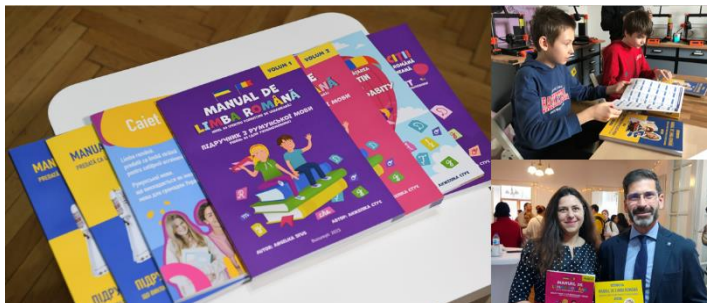
28 February, launching event of textbooks of Terre des hommes (Tdh).

On 28 February, UNHCR participated in the launching event of seven textbooks in Romanian for Ukrainian children and teenagers published by Terre des Hommes (TdH) in Bucharest, as part of UNHCR's funded TdH project. These books are the first resources of this kind in Romania that contain the translation of texts into Romanian with Cyrillic letters. The UNHCR Representative attended the event and addressed the participants. Since 2022, UNHCR works with TdH and offering child protection services such as tailored information, referral to specialised services, mental health, psychosocial support and educational assistance in different cities in Romania, i.e. Maramures, Brasov, Constanta and Bucharest.