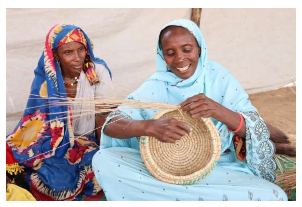
Community psychosocial support for refugee women showing at the Korsi-Birao site in the Central African Republic.