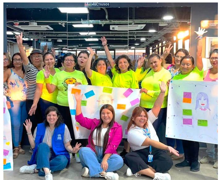
Women from different communities in Mejicanos participating in activities organized by UNHCR to commemorate International Women's Day.