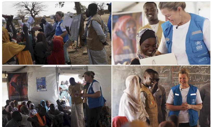
Visit of the Deputy High Commissioner for Refugees @ UNHCR Chad and West & Central Africa