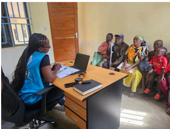
A UNHCR staff member interviews a Congolese refugee family for resettlement in Nyarugusu Camp.