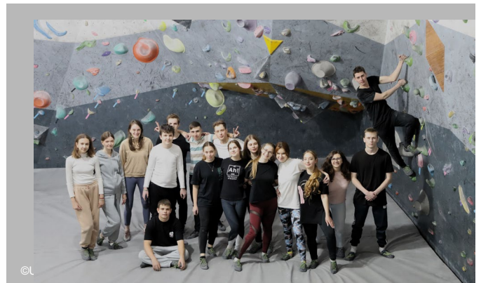
MOLDOVAN NATIONAL YOUTH COUNCIL ROCK CLIMBING EVENT