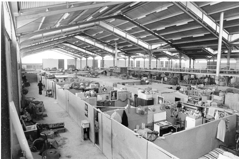
In 1974, some 400,000 people were internally displaced in Cyprus. UNHCR arrived on the island and coordinated humanitarian aid, including food, health and shelter provision.

UNHCR has been present in Cyprus since 1974 when it arrived on the island to provide humanitarian aid for the displaced populations in both communities. By 1998, the need for relief assistance for internally displaced Cypriots had declined, and UNHCR handed over the work to other UN development agencies. With the increase of refugee arrivals in 1998, and in the absence of national asylum legislation and infrastructure, UNHCR had to assume the responsibilities for registering asylum-seekers arriving on the island and processing their applications. In 2000, the Republic of Cyprus adopted its first national refugee legislation and asylum procedures, and in 2002 it took over from UNHCR the responsibility for asylum adjudication.