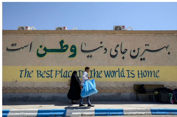
On World Refugee Day 2022, the UNHCR Country Office in Cyprus and Universitas Foundation presented the photographic exhibition Fleeing to Safety , featuring the work of Sebastian Rich.