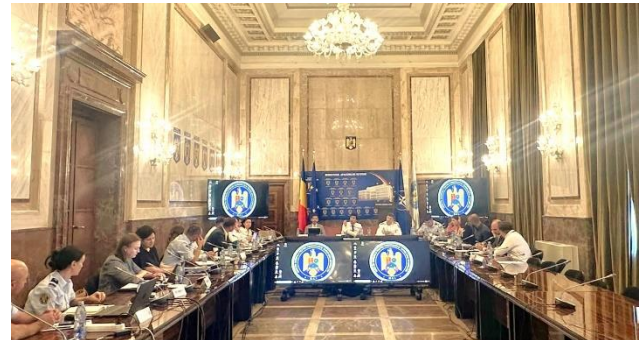
30 July, a working meeting at the headquarters of the Ministry of Internal Affairs on preparedness capacity and contingency planning.

(Department for Emergency Situations, General Directorate for Civil Protection, and Service for Coordination and Implementation of Resilience Requirements). On 30 July, DSU held a workshop on preparedness capacity and contingency planning with the Moldovan delegation and officials from UNHCR Moldova and UNHCR Romania. The Moldovan delegation also participated in field visits, including to DSU's National Centre of Intervention Management and Coordination in Ciolpani, and UNHCR's integrated service hub at RomExpo, Bucharest.