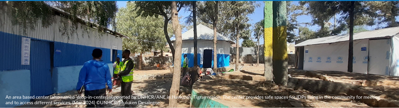
An area based center (also named "drop-in-center") supported by UNHCR/ANE in Hawuzen, Tigray region. The center provides safe spaces for IDPs living in the community for meeting and to access different services. (Mar 2024)