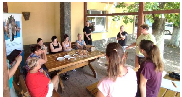
Focus Group Discussion in Timisoara on 6 August.

Last week, UNHCR, in collaboration with its partners, conducted several Participatory Assessments in Sânnicolau Mare, Buzau, Galati, Constanta, and Bucharest. Nearly sixty refugees from Ukraine participated in the Focus Group discussion on livelihoods and economic inclusion, access to documentation and social protection, and child protection.