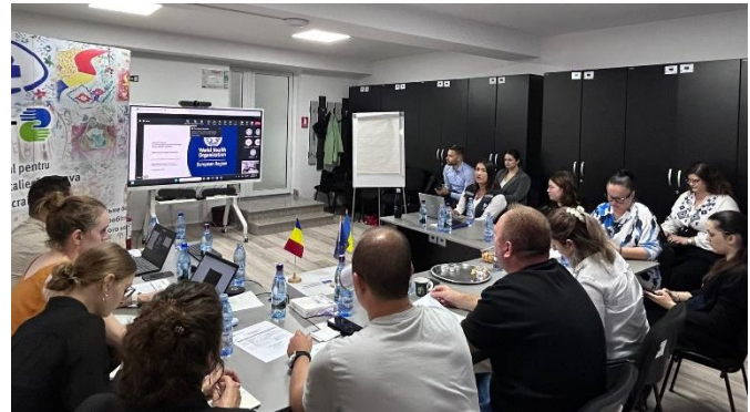
Inclusion Working Group Meeting in Suceava on 12 September .

On 12 September, the Refugee Inclusion Working Group in Suceava convened its monthly meeting to address various important issues. The meeting agenda primarily focused on planning for winter response preparedness, ensuring smooth school enrolment for refugee children, establishing effective referral