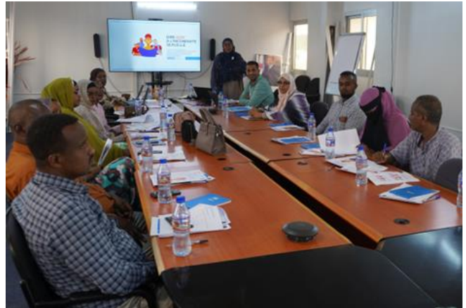
UNHCR implementing partners received training on the Prevention of Sexual Exploitation and Abuse (PSEA) at UNHCR office in Djibouti

UNHCR attended the 2nd ordinary session of the Djibouti parliament. On 1 October, UNHCR Representative attended the 2nd ordinary parliamentary session of 2024. The session hosted by the parliament president, was attended by cabinet members headed by the Prime Minister, members of parliament, diplomatic corps, and representatives of international organizations and civil societies. UNHCR took this opportunity to thank the President of the Parliament, second personality of the country, for his leadership and all the work the parliament is delivering regarding refugee laws.