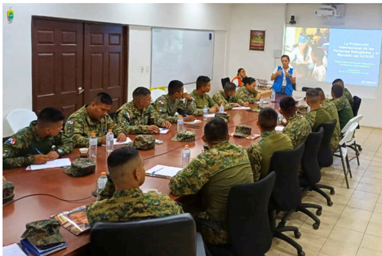
In September, UNHCR and NRC trained 109 SENAFRONT officials and staff from the Public Prosecutor Office Administrative branch on international protection and the Agency's mandate. For more information on UNHCR's work in Panama, click here .

UNHCR supports the Government's response at the Temporary Reception Centres (ETRM in its Spanish acronym) and to host communities in Darién and Chiriquí. With the Norwegian Refugee Council (NRC), UNHCR offers legal support to people with international protection needs and refers individuals requiring specialized assistance to relevant institutions. UNHCR and NRC also provide information on the asylum system in Panama and assist with refugee status applications. Through HIAS, UNHCR provides Mental Health and Psychosocial Support (MHPSS) and provides people in transit with information on the risks of the route through informative sessions. Through the Panamanian Red Cross (CRP), UNHCR delivers primary health care to refugees and migrants at the Government's ETRMs.