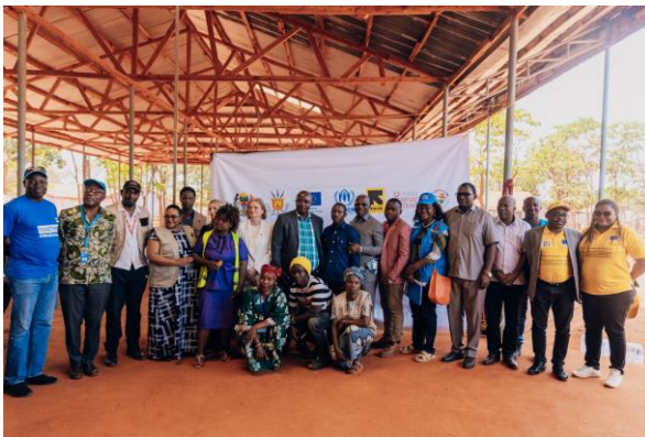
Governments of Tanzania and Burundi, Ambassadors of EU in Burundi, and Tanzania, Heads of Cooperation from Belgium, France, Ireland, Japan, UK, and USA, UNHCR and partners, together with refugees launch the EU cross-border project in Nyarugusu Camp.

refugee and host community participants supported with Technical and Vocational Education and Training.