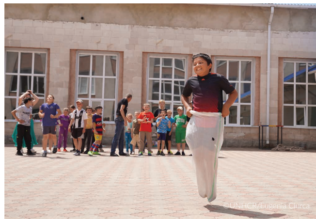
Children in the village of Popeasca, celebrating the Children's Day a day earlier. Refugee and Moldovan children enjoyed a day of recreational activities organized at the Refugees Accommodation Centre. On May 30 and 31, UNHCR in collaboration with partner organizations and local authorities organized a series of activities in celebration of Children's Day for Moldovan and refugee children.

UNHCR and UNICEF are assisting the Ministry of Education and Research in developing a roadmap and action plan to ensure the full inclusion of refugee children in Moldovan schools. The Education Working Group partners collaborate on this initiative by contributing to the document's development, budgeting for necessary activities, and fundraising to support the plan's implementation. This collective effort aims to create a supportive and inclusive educational environment for all refugee children in Moldova.