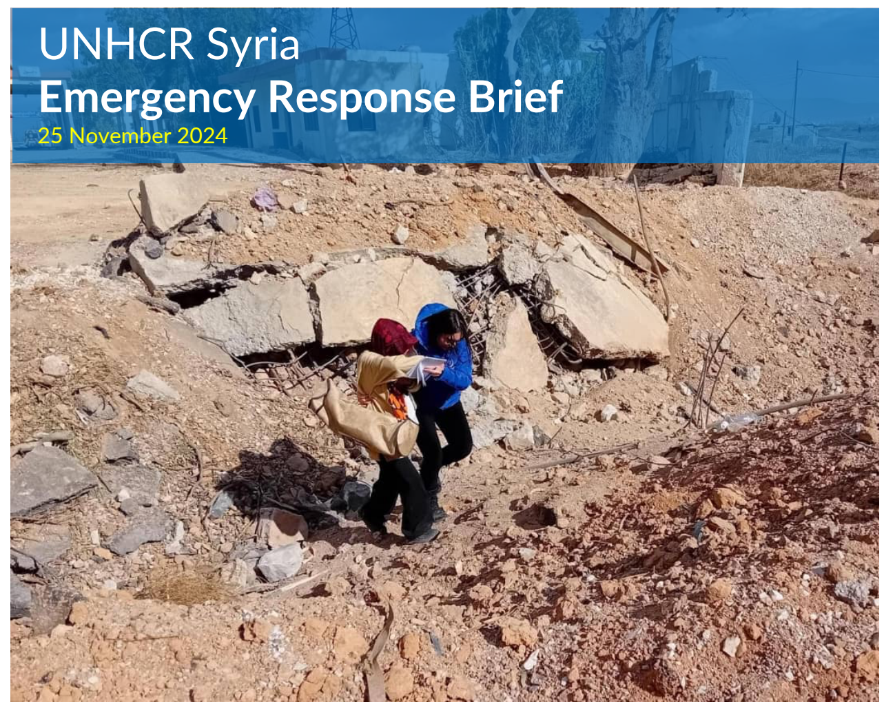
UNHCR assisting a vulnerable returnee to cross the crater in the road following the recent attack on Joussieh Border Crossing in Homs