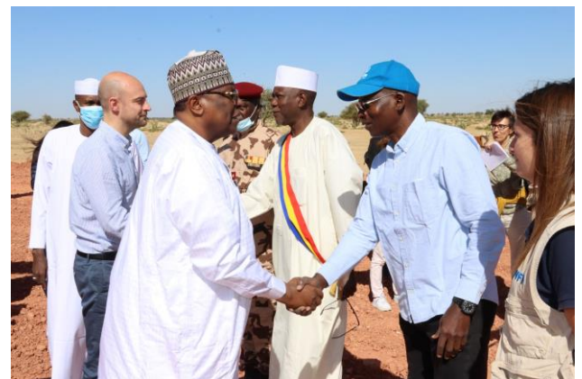
Mission of the French Minister for Foreign Affairs, his Chadian counterpart, the Under-Secretary-General of the United Nations for Humanitarian Affairs, the Resident Coordinator of the United Nations System in Chad, and the UNHCR Representative in Adré.