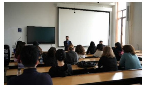
UNHCR Representative talking to students of the Sociology and Social Work Faculty at the University of Bucharest.