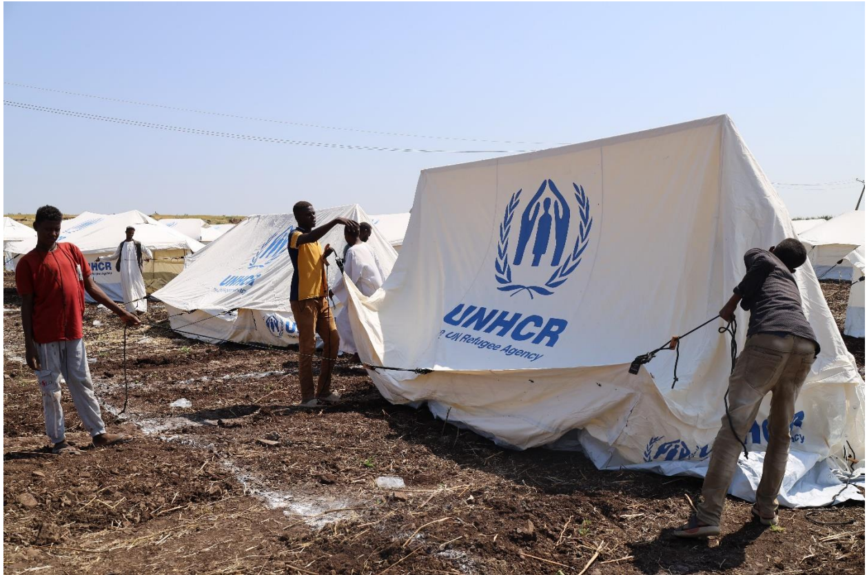
Displaced youth helping set up UNHCR tents at the Qebesha gathering site in Gedaref, Sudan.