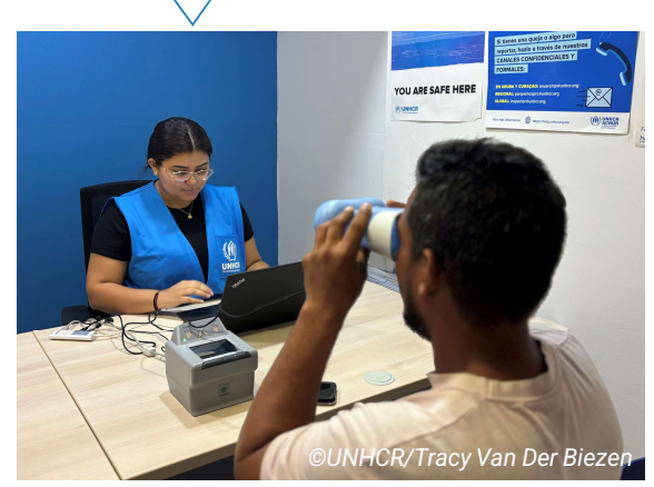
UNHCR Biometric registration in Oranjestad, Aruba