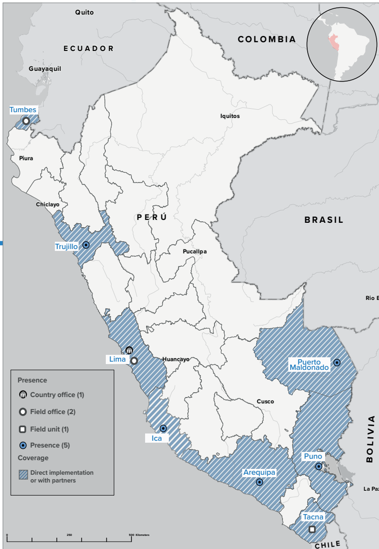
The boundaries and names shown and designations used on this map do not imply official endorsement by the United Nations.

Peru is home to 1.54 million Venezuelans, making it the second-largest host country for forcibly displaced Venezuelans after Colombia. As of June 2024, Peru hosts 508,488 asylum-seekers, primarily from Venezuela. These figures are currently under review due to the ongoing asylum backlog validation process. More than 1 million Venezuelans reside in Lima. Thirty-two per cent of Venezuelan nationals in Peru live in monetary poverty, and 10 per cent live in extreme poverty. Upon arrival, forcibly displaced individuals face significant vulnerabilities, including an inability to generate income, which increases their risk of falling into poverty and resorting to negative coping mechanisms such as child labor, sexual exploitation, and begging for food.