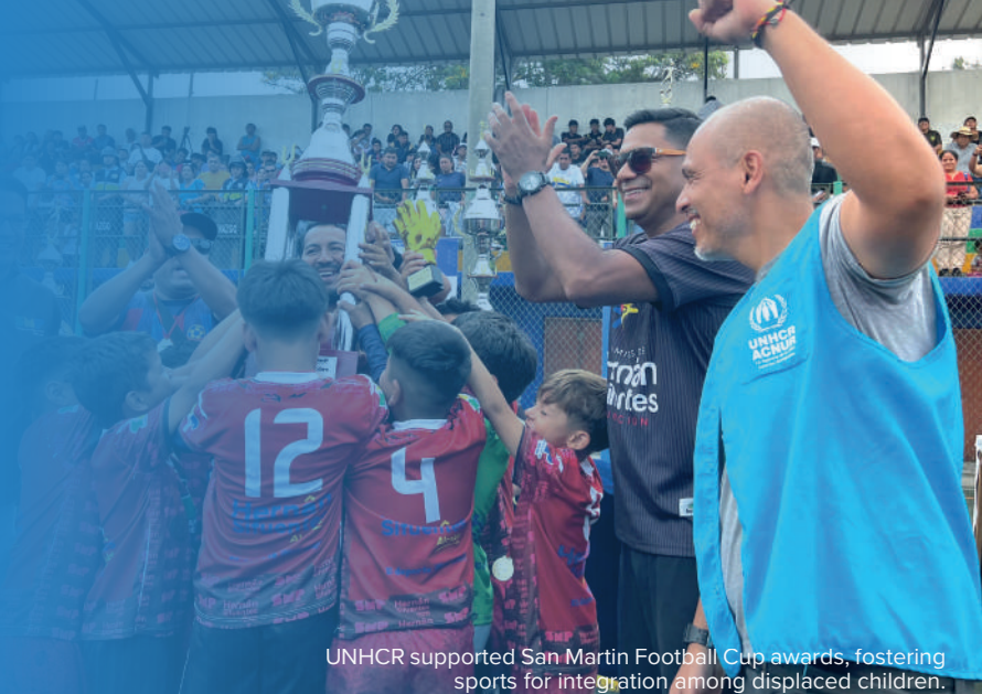
UNHCR supported San Martin Football Cup awards, fostering sports for integration among displaced children.